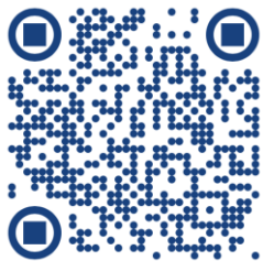
Audio Only Code